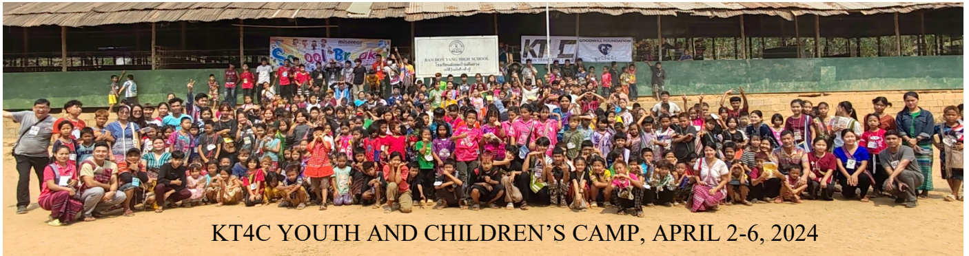
KT4C YOUTH AND CHILDREN'S CAMP, APRIL 2-6, 2024

Published by Ethnos Asia Ministries (EAM) as a Prayer Guide on Access-Restricted Nations in Asia (ARNA).